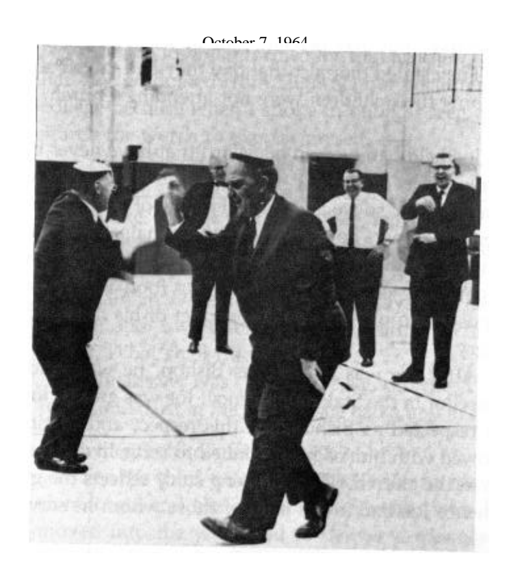
High Council Social October 7, 1964